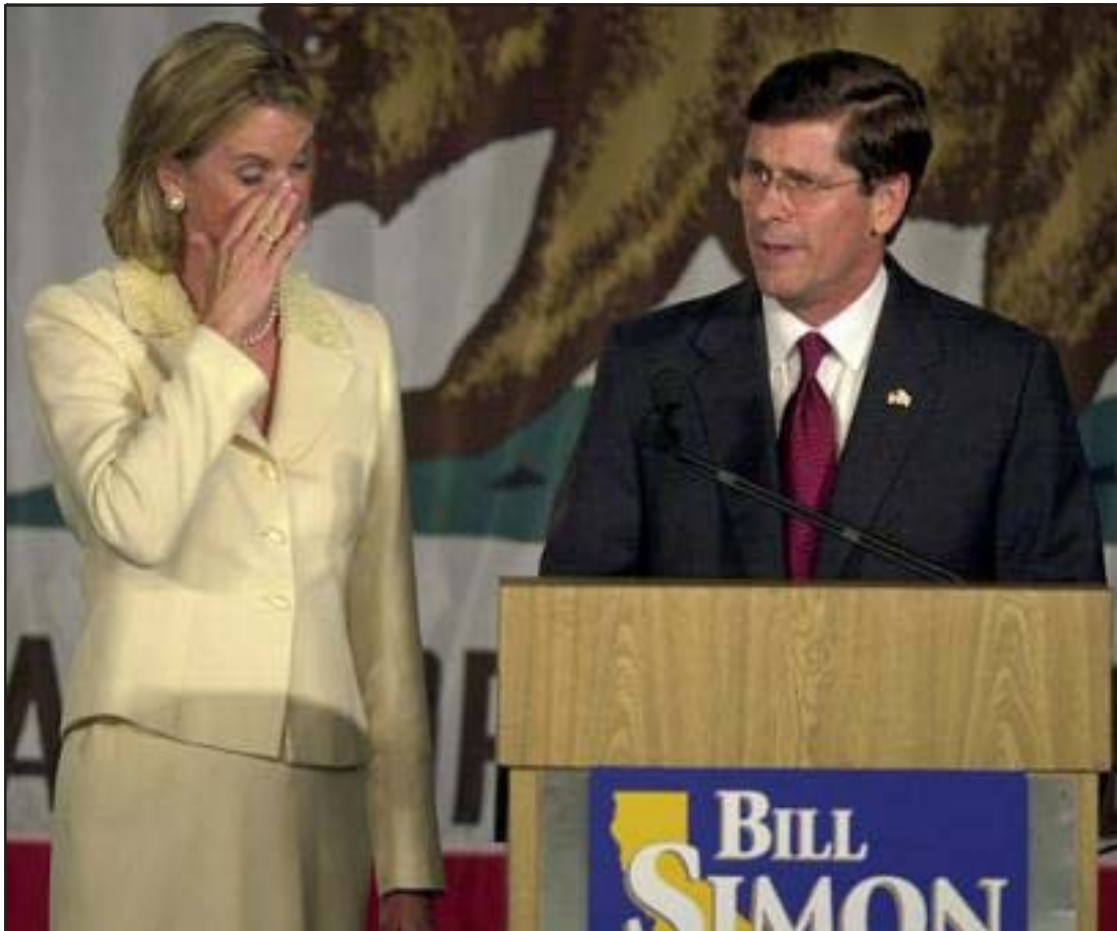
Republican candidate Bill Simon with wife following his defeat to incumbent Gray Davis.