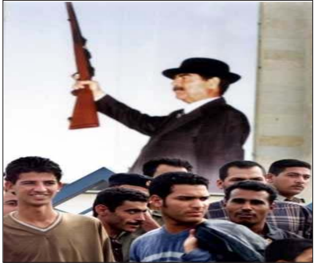
Young Iraqis beneath the propaganda of their president, Saddam Hussein.

had allowed Hitler to conquer the world. But would anybody really wanted to have that kind of peace? Peace by itself should never be a policy goal. Peace without justice can be worse than war. The only type of peace worth having is peace with Justice.